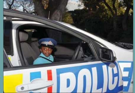
A future Commissioner of Police tries out his future ride.