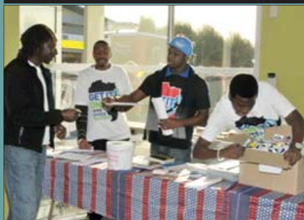
Community members distributing condoms.