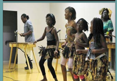
Traditional dancing at Africa Day 2011 celebrations in Christchurch.